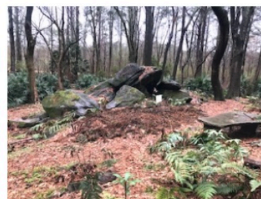
Rock mound landscape feature