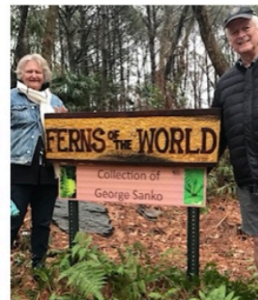
Ferns of the world sign