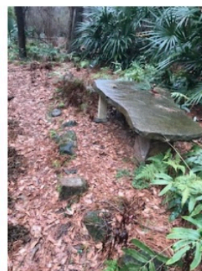
Nice natural garden seat