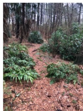
Inviting curved path